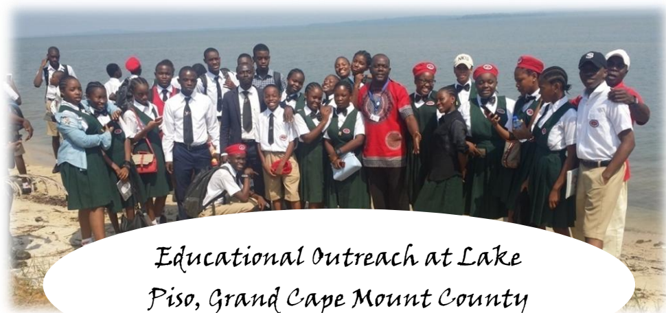
Educational Outreach at Lake Piso, Grand Cape Mount County