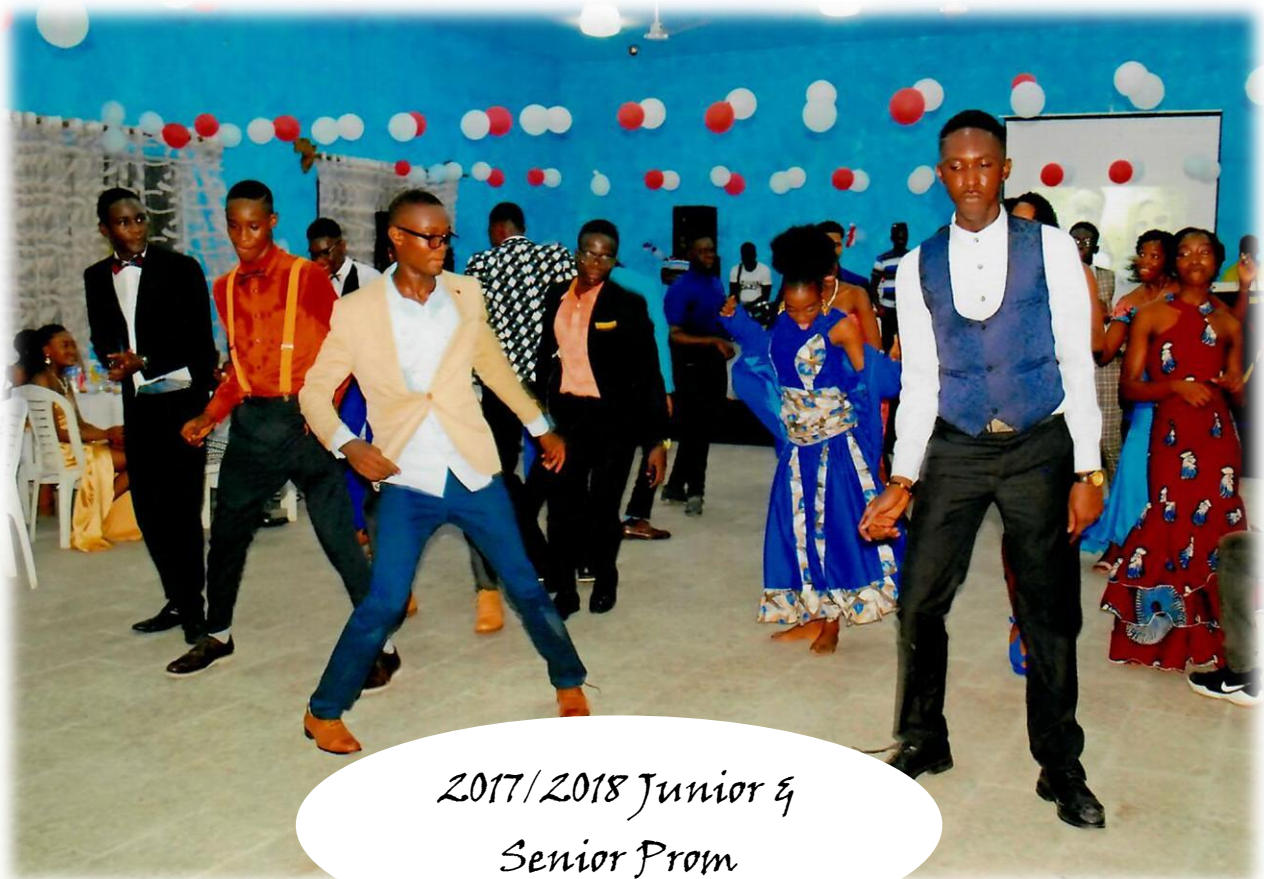
2017/2018 Junior & Senior Prom