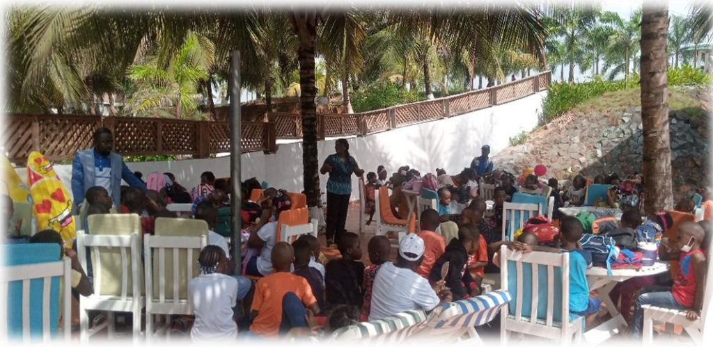
John W. Gbassay Beach Resort