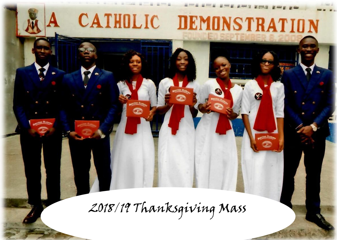
2018/19 Thanksgiving Mass