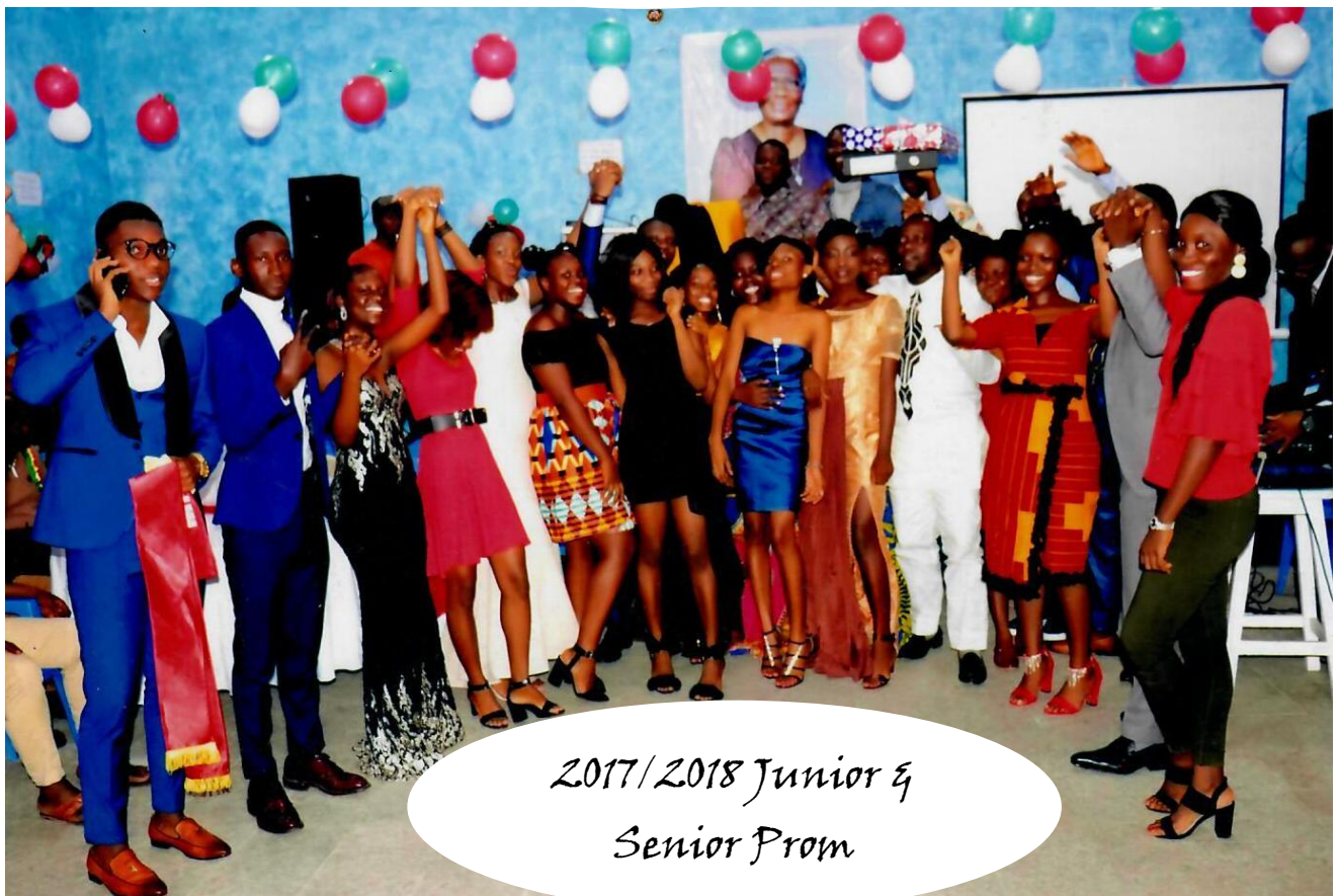
2017/2018 Junior & Senior Prom