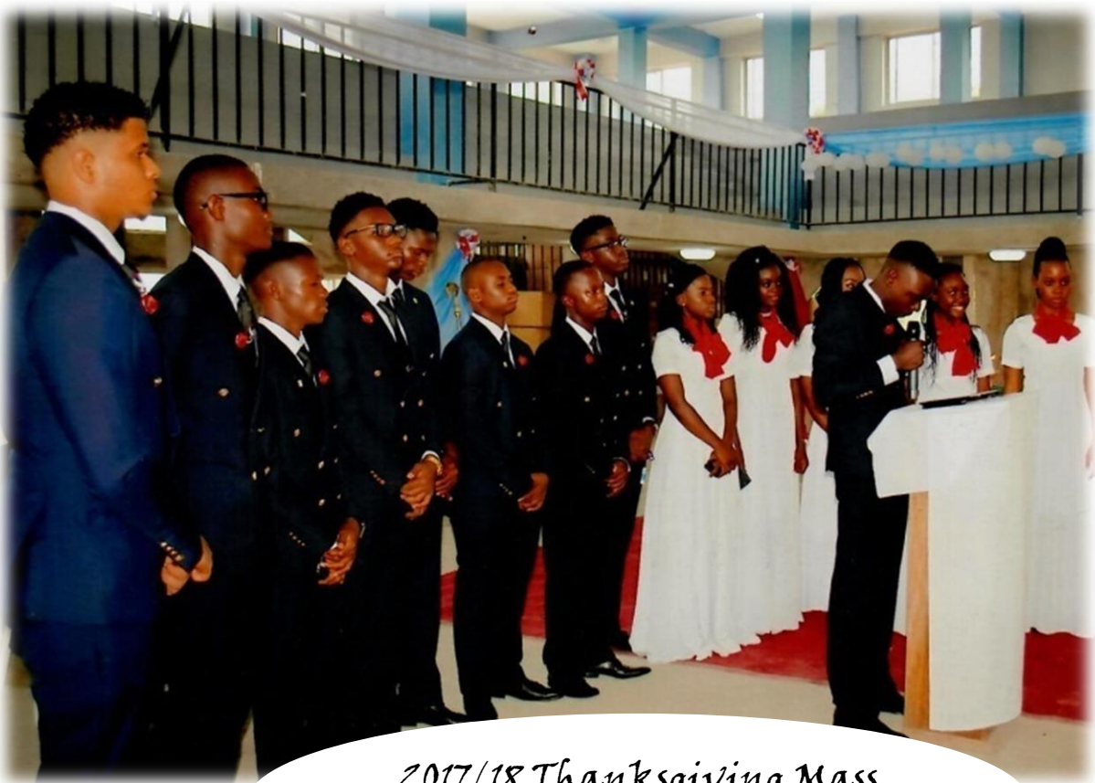
2017/18 Thanksgiving Mass