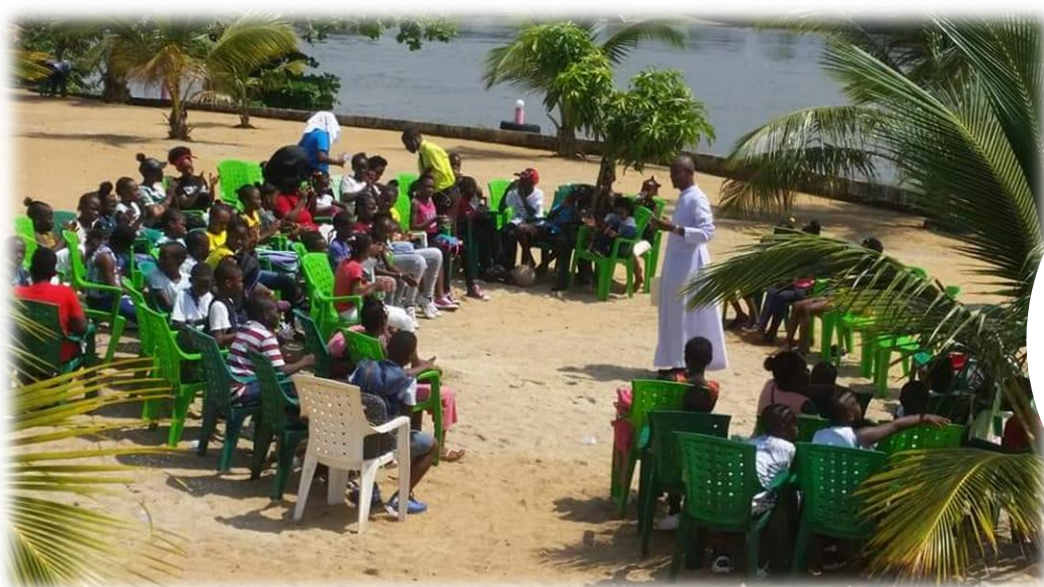
Retreat at Riverside Resorts, Hotel