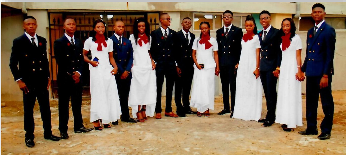
First Graduating Class